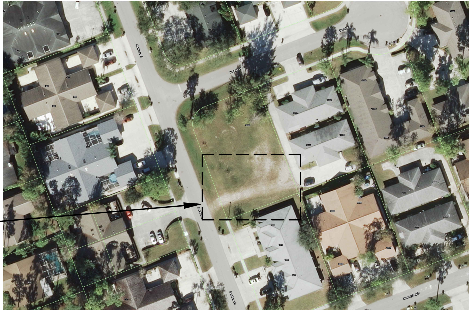
EXISTING SITE PLAN & SCOPE OF WORK Scale: 1:200

PROPOSED LOCATION OF NEW HALF BASKETBALL COURT