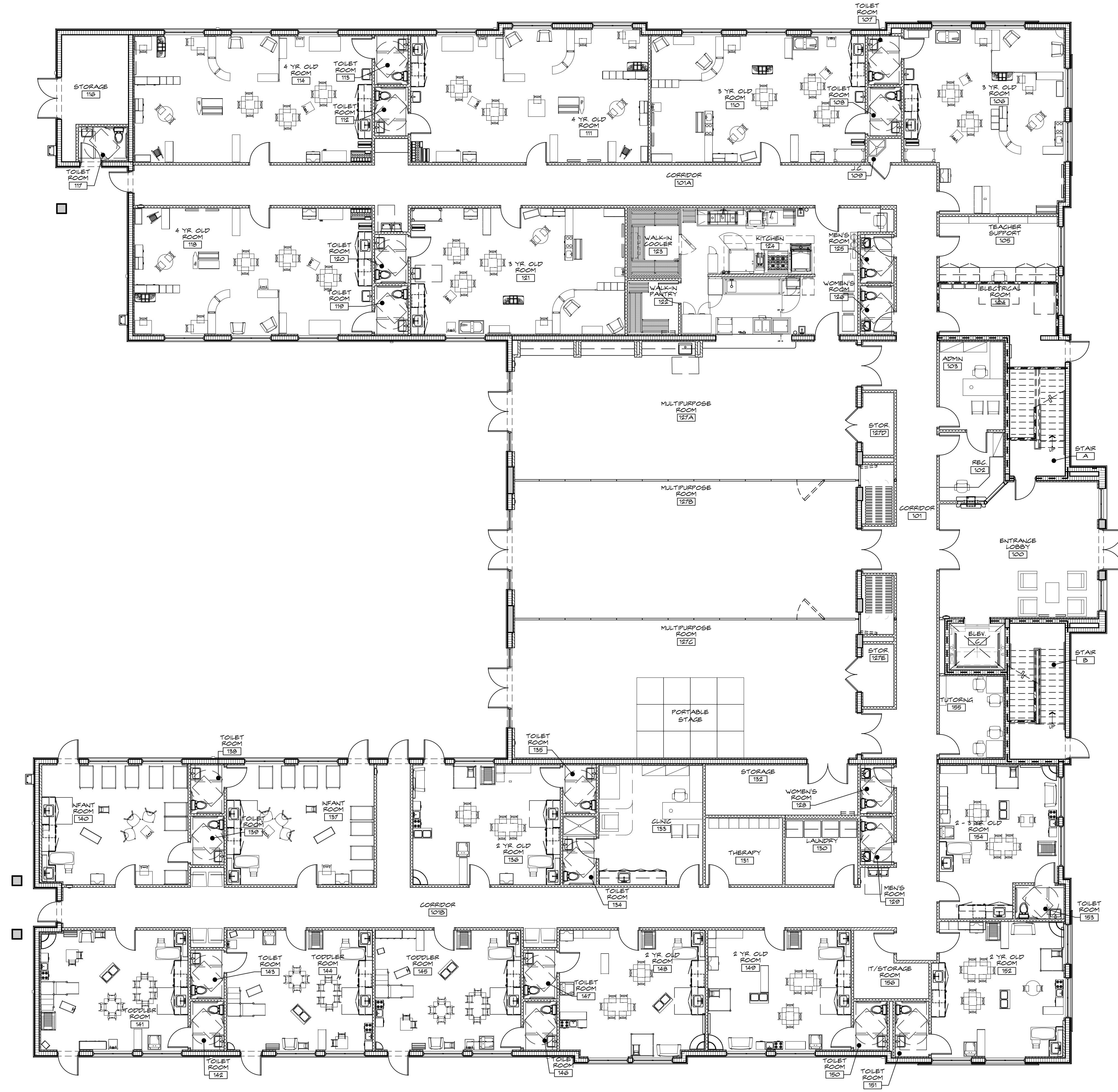
1 FIRST FLOOR FURNITURE PLAN SCALE: 1/8" = 1'-0"

FURNITURE GENERAL NOTES A. FURNITURE SHOWN FOR COORDINATION PURPOSES ONLY. OWNER TO PROVIDE FURNITURE, GC TO INSTALL. B. OWNER TO SELECT AND PROVIDE REQUIRED PLAYGROUND AMENITIES. GC TO INSTALL PLAYGROUND EQUIPMENT UNDER SEPARATE CONTRACT AMENDMENT.