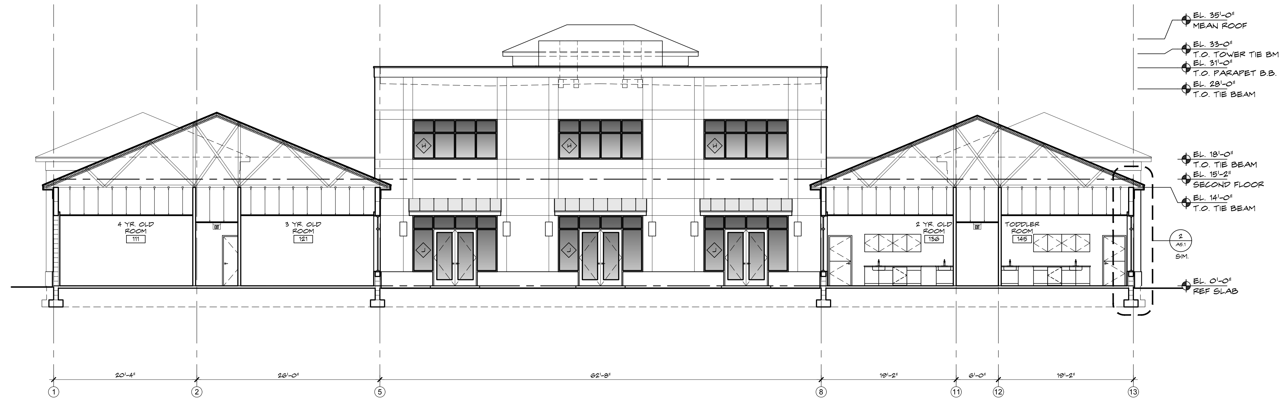
2 PROPOSED BUILDING SECTION LOOKING SOUTH SCALE: 1/8" = 1'-0"