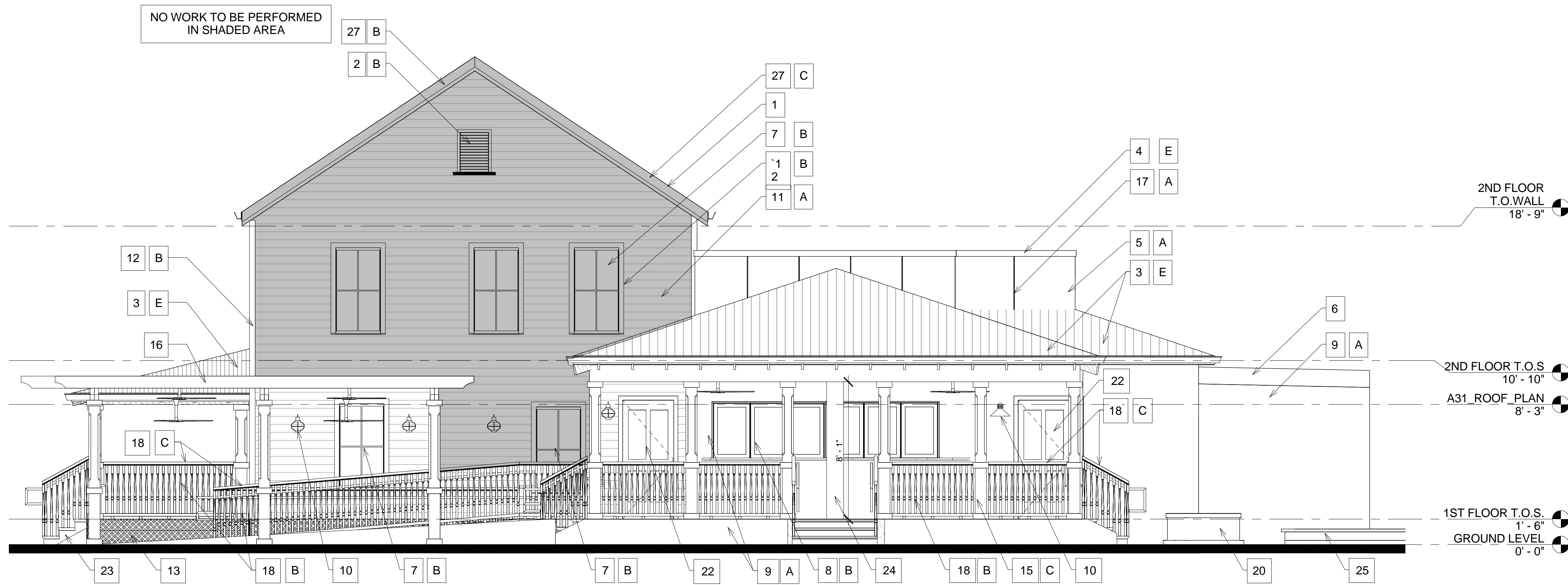
1 EAST ELEVATION SCALE: 1/4" = 1'-0"

©2016 AW ARCHITECTS, INCORPORATED ALL RIGHTS RESERVED. NO PART OF THESE IDEAS, PLANS OR DESIGNS MAY BE REPRODUCED, COPIED OR UTILIZED GRAPHICALLY IN ANY FORM WHATSOEVER WITHOUT THE EXPRESSED WRITTEN CONSENT OF AW ARCHITECTS INCORPORATED AND ITS BOARD OF DIRECTORS.