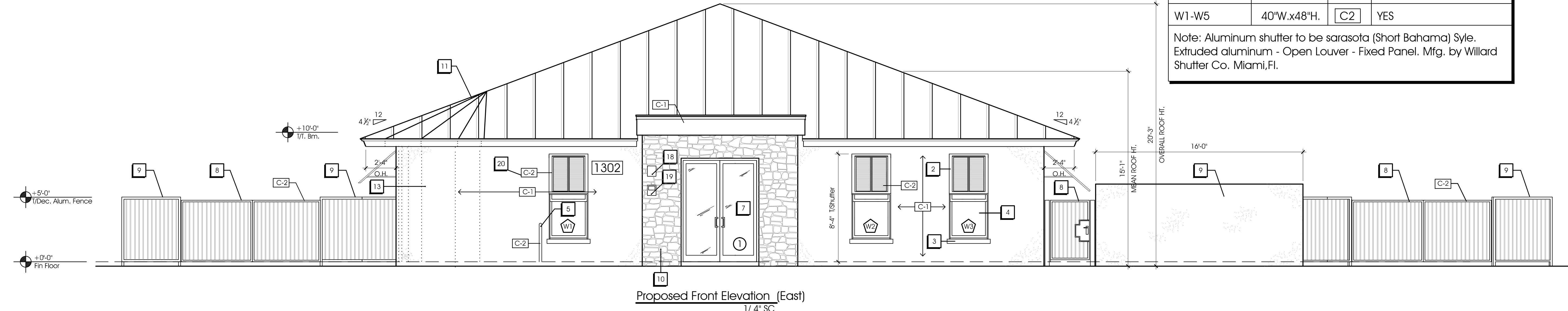
Proposed Front Elevation (East) 1/4" SC

Kelly Building for: Schmidt Investment Properties, LLC 1302 Wallace Drive Delray Beach, FL 33444