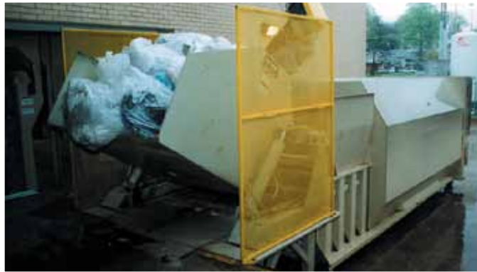
This RJ-250SC is located at a hospital and features a dock-level tipper system. Bags of waste are put directly onto the tipper and dumped into the compacter. The self-contained compactor effectively solves spillage and leakage problems associated with conventional stationary compactors and containers.

Medical centers generally require a high degree of security and sanitation. The RJ-250SC provides both. Waste is safely stored out of reach of scavengers. Sanitary conditions are enhanced even further with the Marathon Ozone Odor Control System, which destroys odor-producing bacteria by molecular reaction. At this medical center installation, cardboard is the main material processed for the purpose of recycling, with a customized dock application and a 48-gallon cart dumper system installed.