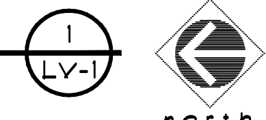
LOW VOLTAGE PLAN SCALE: 1/8" = 1'-0"