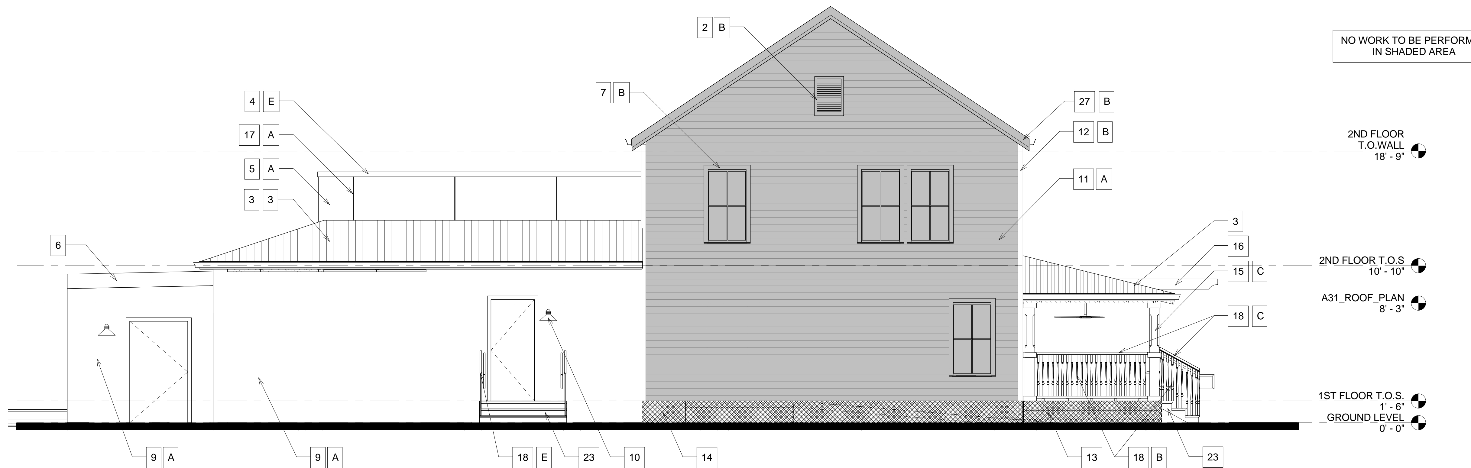
1 WEST ELEVATION SCALE: 1/4" = 1'-0"